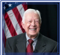
James Earl Carter Jr. 1924-2024 39th President of the United States

As we pay tribute to President Carter at his passing at 100 years, and in the spirit of Martin Luther King Jr., whose memory we celebrate on January 20th this year, perhaps you can find the time to make it a day of service to others. We sincerely hope everyone has a very happy, healthy, and impactful New Year!