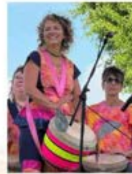
Tammi Hessen Bumbada Women Drummers